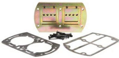
Small Reciprocating Valve Kits