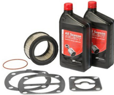
Small Reciprocating Maintenance Kits