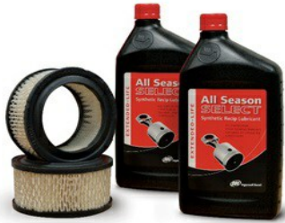
Small Reciprocating Start-Up Kits