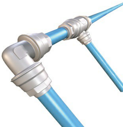
SimplAir Compressed Air Piping