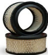
Small Reciprocating Air Filter Elements