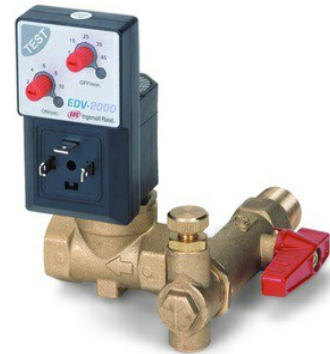
Electronic Drain Valves